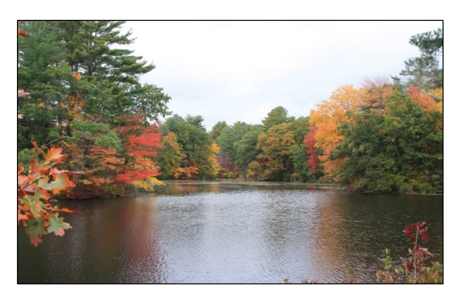
Spindleville Pond.